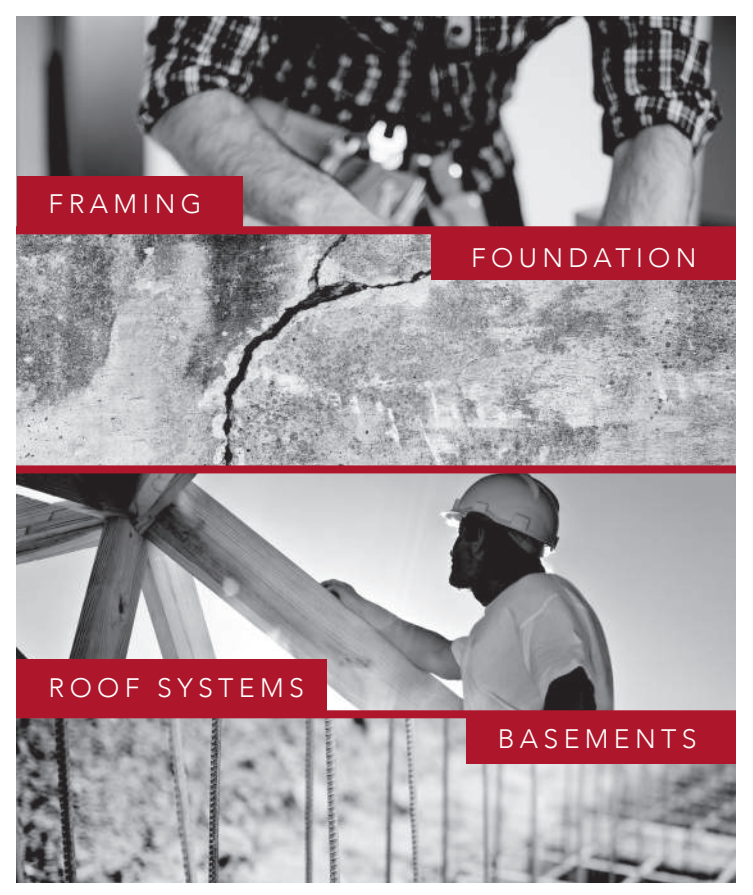
Residential Warranty Services / NXT Warranty Form A, Rev. 5/22

This policy was delivered to the home owner free of charge by their home inspector. For copies of any RWS printed materials, please call the RWS offices at 1-800-544-8156.